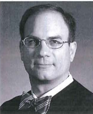
Hon. Victor J. Wolski United States Court of Federal Claims