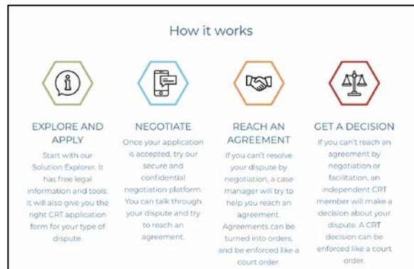
Figure 2 - CRT dispute resolution process

During system design, the CRT development team anticipated that peak usage would be after business hours and on weekends. However, web analytics show that the majority of users are accessing CRT services during traditional business hours, and more often than not, through tablets and smartphones.