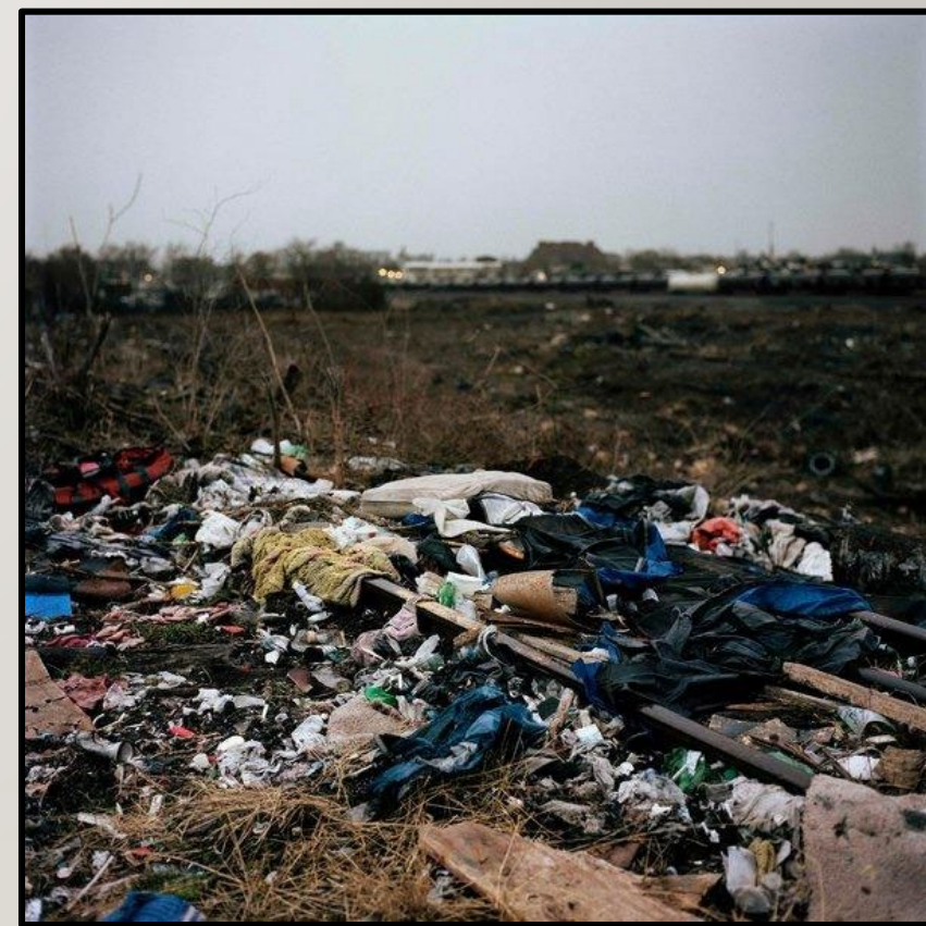
Photos of Kensington, Philadelphia from the NY Times feature, “Trapped by the ‘Walmart of Heroin’”